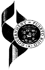
EXHIBIT H NON-CONFLICT OF INTEREST CERTIFICATION NON-FEDERAL MATCH PROGRAM FOUNTAIN CHRISTIAN BILINGUAL SCHOOL-GUAYAMA