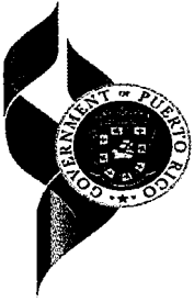
EXHIBIT D - BUDGET